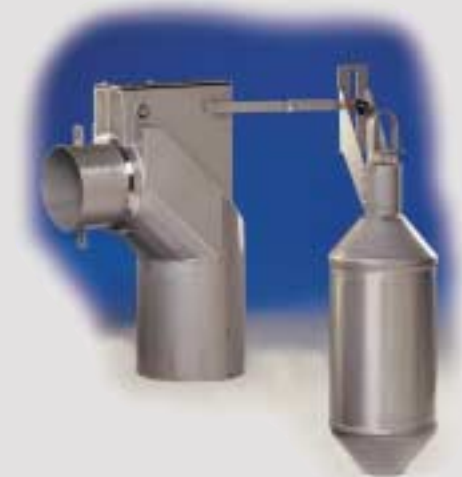
Ecostop's oil spill control (patent pending)